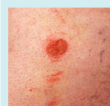
More complex skin issues